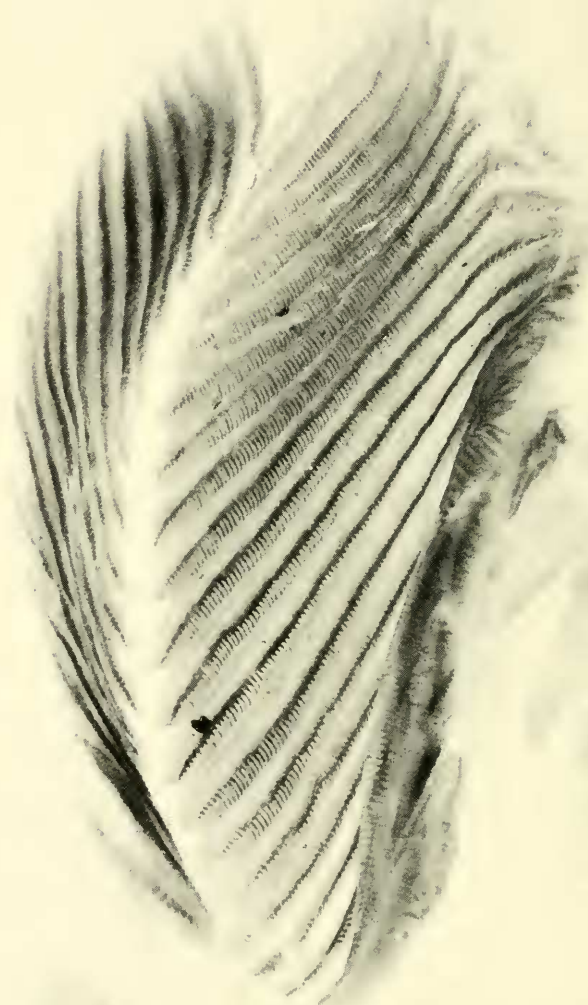
FIG. 3. Details of flouces and minute spines in the medial pocket of inverted left hemipenis of Opipeuter xestus (UMMZ 69559). The median welt has been folded back to show the apices of the chevron-shaped flouces ( \times 27 ).